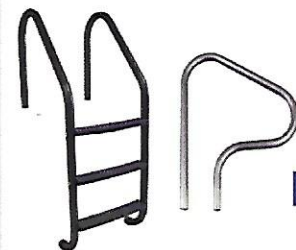
RAILS & LADDERS