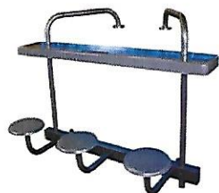
OVER THE EDGE